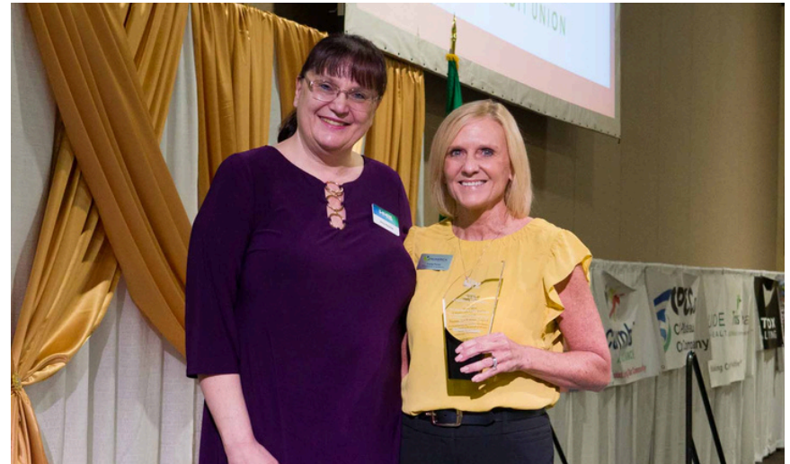
NUMERICA CREDIT UNION 2024 TRI-CITIES CHAMPION OF DIVERSITY AWARD RECIPIENT